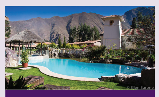
ARANWA SACRED VALLEY HOTEL & WELLNESS

A 5-star, luxury property, built along the Vilcanota riverbank, on the lands of an old 17th- century, colonial hacienda.