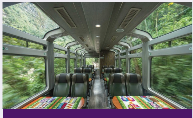
OCT 13TH - DAY 6

Included Meals: Breakfast and Dinner Accommodation: Aranwa Resort Hotel